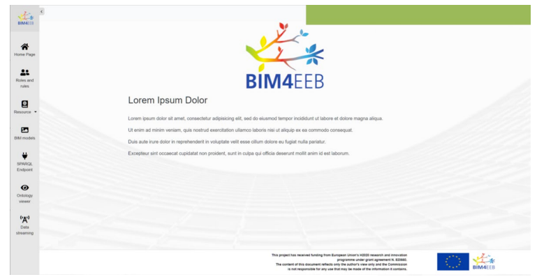
Figure 2 BIM4EEB platform

At present, the partners have defined the user profiles for accessing the BIM Management System and the overall schema for visualising ontologies and data. A draft of the web interface for the system has already been developed and it will be improved and implemented in